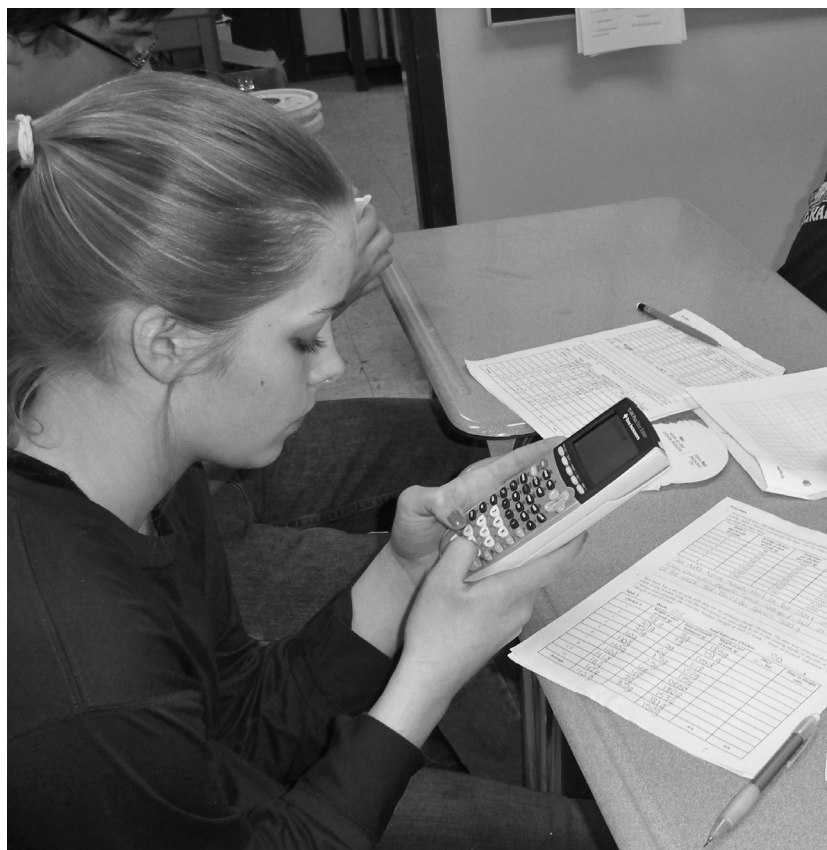
Students may need coached in what is important to write down. Some activities may only have color changes that occur, some have number of drops that you count, some shop activities are simple answers, like "did the engine start?"

Creating good solid inquiry lessons is challenging and will test your creativity and organization. However, it also will stretch your students, engage them in challenging topics and create true meaning of what is going on in the lesson. I think it's easy to see that the benefits outweigh the work required to pull off an inquiry lesson. And the more inquiry you use, the better you will get.